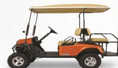
S4 HIGH OUTPUT