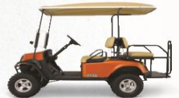
S4 HIGH OUTPUT